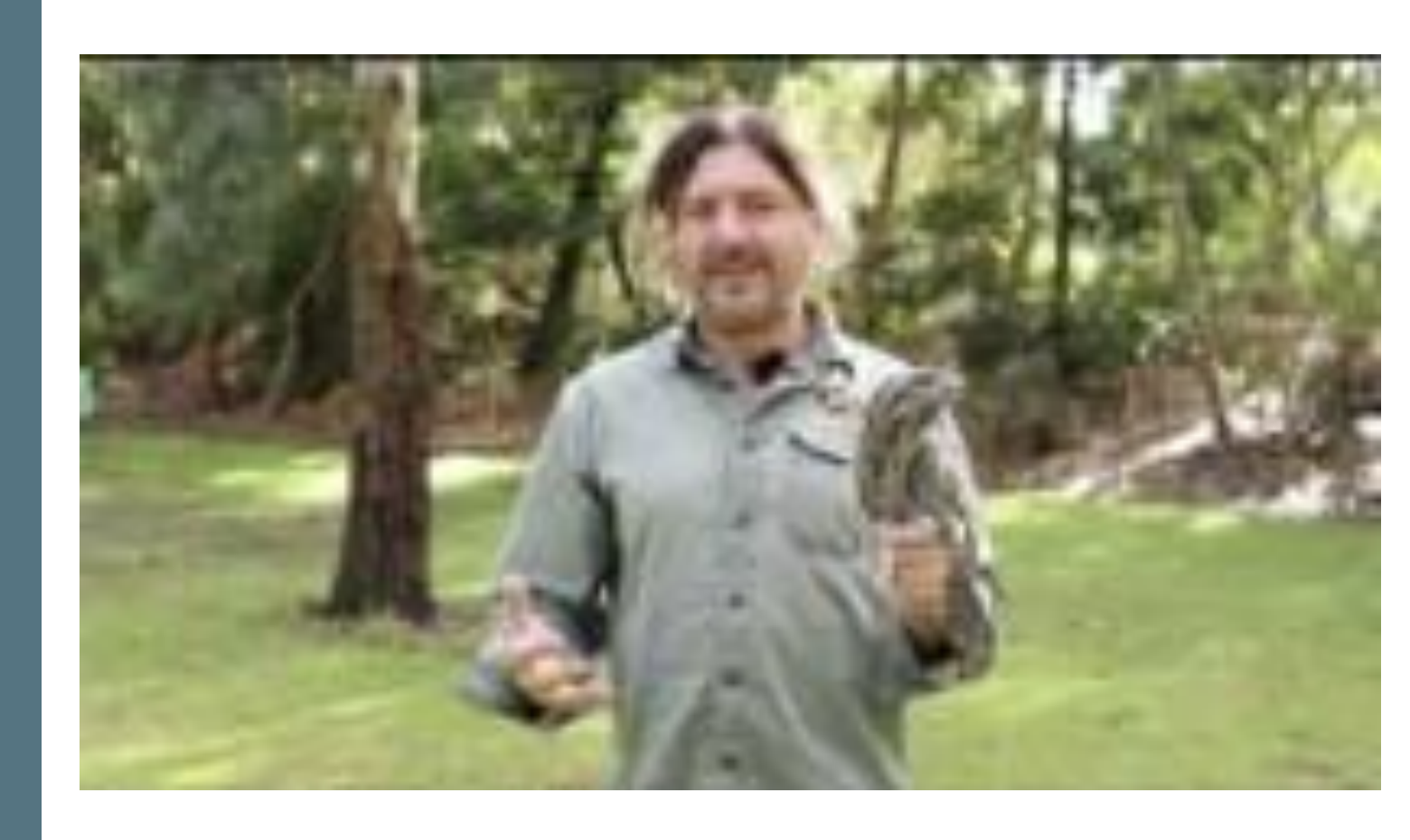
Mount Barker A City Growing With Nature - YouTube