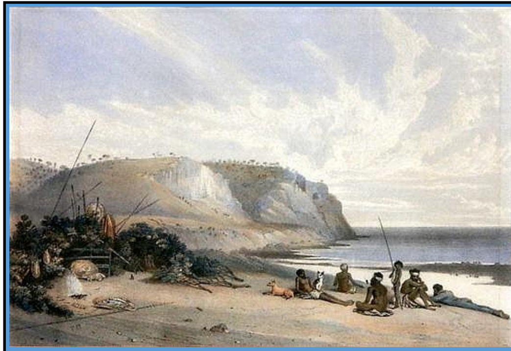
George French Angas (1822-1886), Rapid Bay, Encampment of Yan

George French Angas as a pioneer Australian ethnographer